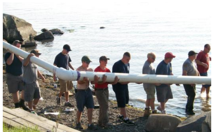
Town of St. Albans volunteers work together to wrestle their newest dry hydrant into position on Sampson Point Road; on Lake Champlain