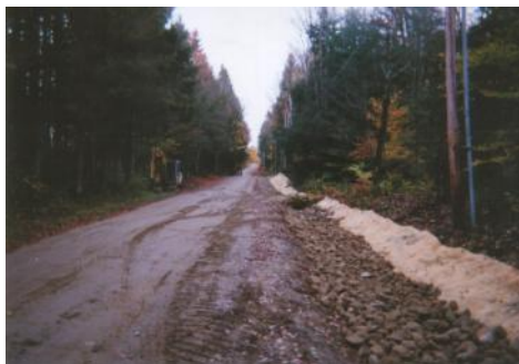
Ditch Work in Ripton (above) and culvert work in Waterbury (below).