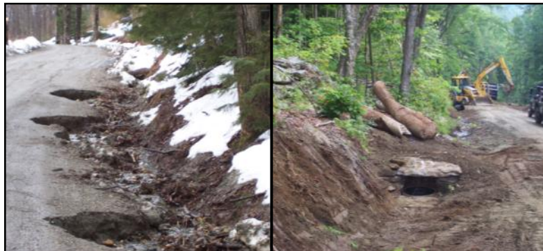
Before & During: Whitingham Ditch & Culvert Work

Consul Neil Kan to increa Action P the back watershe (anecdote lake asso correctin In addit knowledg quality pr many vol was held and culve volunteer develop different major sec College s