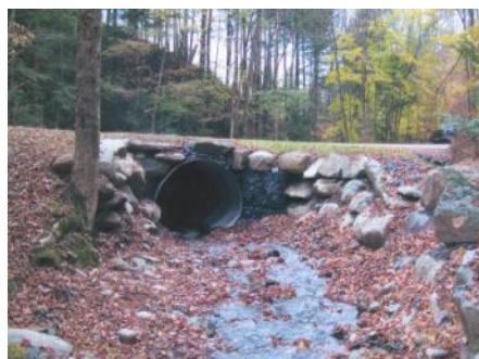
Lake St. Catherine Watershed Road Erosion Inventory and Capital Budget Plan Developed